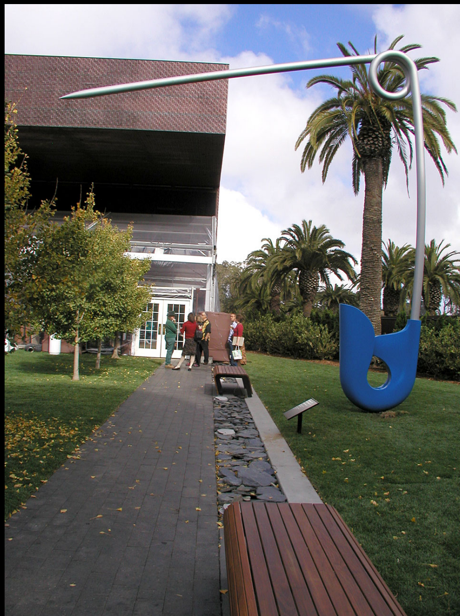
Corridor Pin, Blue, 1999, San Francisco, CA